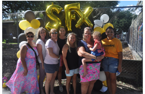
Thank you Home and School Association for a great Back to School Night!